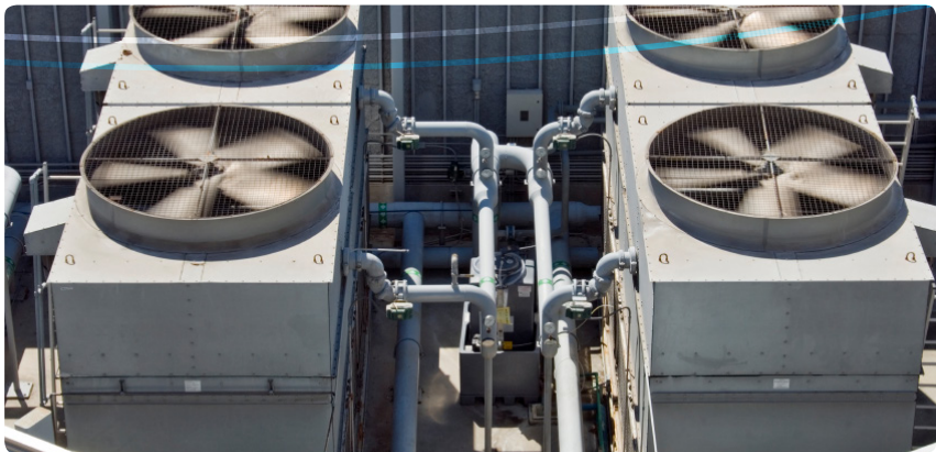
DTEA II™ SR & DTEA II™ SR Plus SC are Patent protected (US Patent 9,090,495)