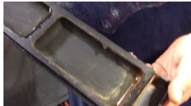
Image 2: BCP 1015-treated chiller surfaces free from bio-organic deposition

BCP 1015, used on a consistent basis (maintenance mode vs cleanout mode), cleans surfaces and reduces the amount of biocide needed.